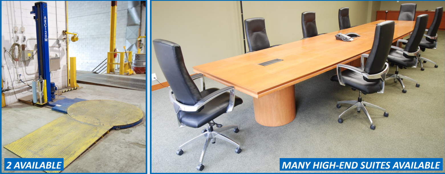
ARTIC M120M TURNTABLE PALLET WRAPPER